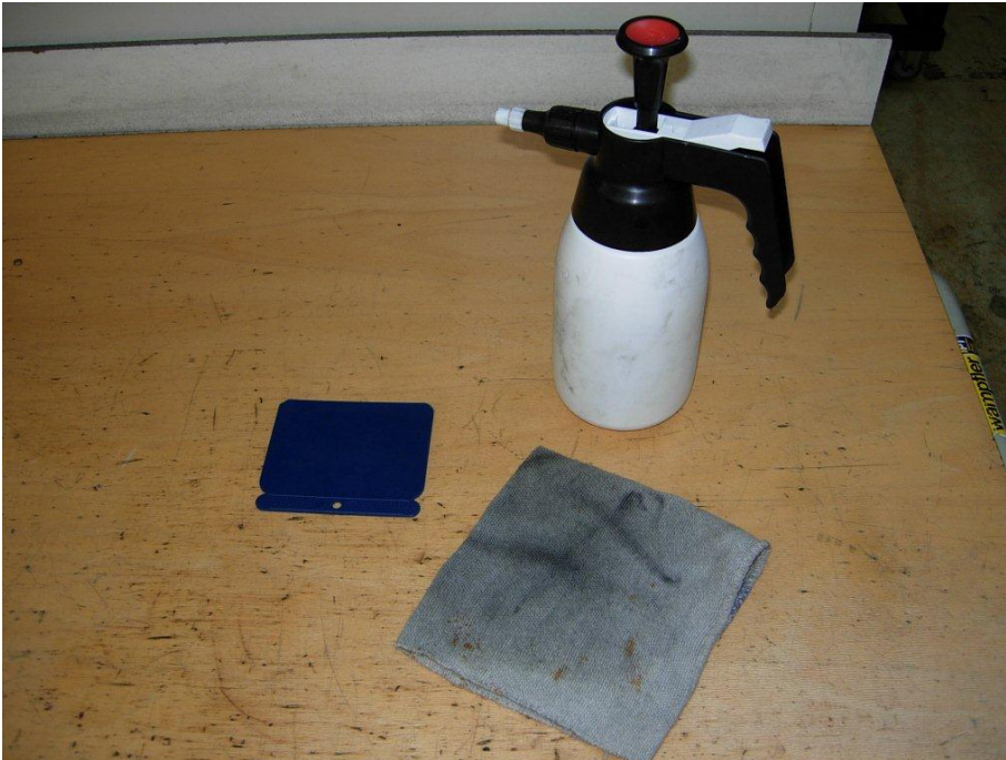
Figure 1: Tools (cloth, spatula and cleaner)