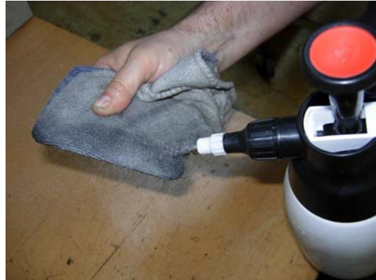
Figure 5: Moisten cloth

Wipe through the engagement slot of the conductor rail. This will loosen and absorb the dirt.