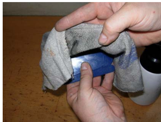
Figure 3: Put cloth over the spatula