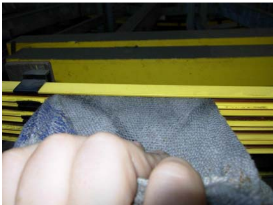
Figure 6: Wipe through the engagement slot of the conductor rail.

Wipe through the engagement slot of the conductor rail. This will loosen and absorb the dirt.