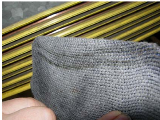
Figure 7: Absorbed dirt