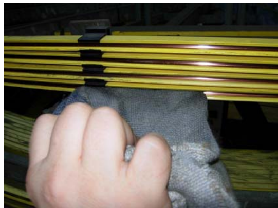
Figure 9: Also remove dirt from the hanger clamps