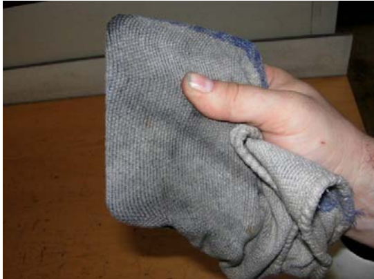
Figure 4: Cleaning tool