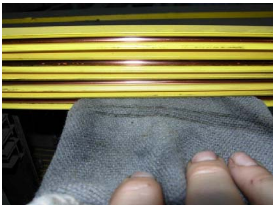
Figure 8: Clean all poles one after the other