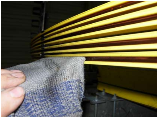
Figure 10: Change the angle of the cleaning tool in order to clean various areas