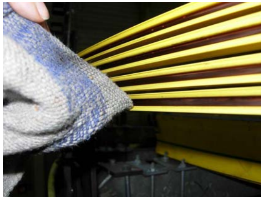
Figure 11: Angle for cleaning the lower area